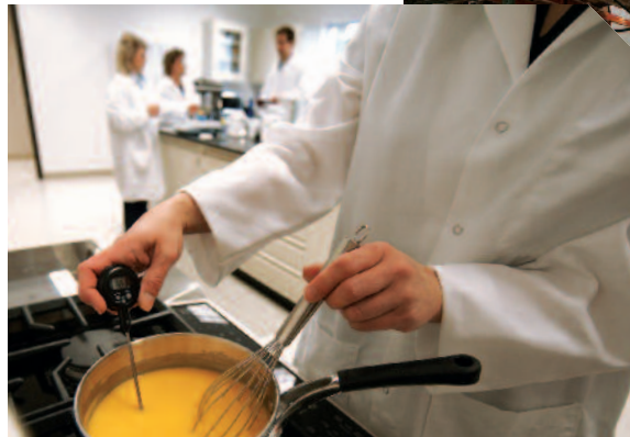
MORE LABORATORIES AND ADDITIONAL SPACE FOR OUR RESEARCH AND APPLICATIONS GROUP.

After running out of available land due to a decade of expansions to its main manufacturing facility, First Choice Ingredients knew it was time to take the next step.