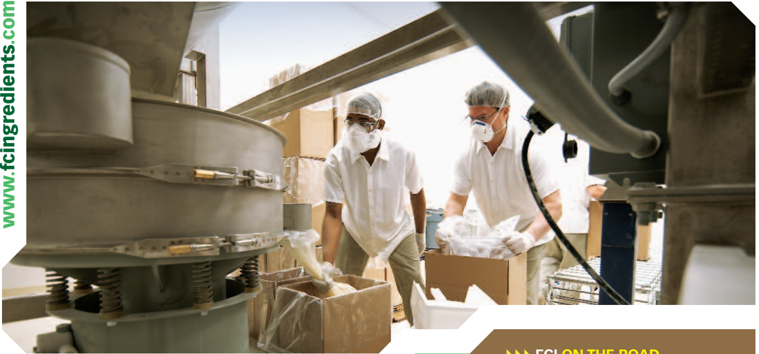
NEW FACILITIES TO RAMP UP PRODUCTION IN 2011.